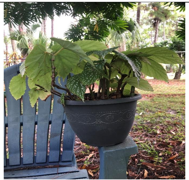
Cane Begonia – a few weeks after grooming