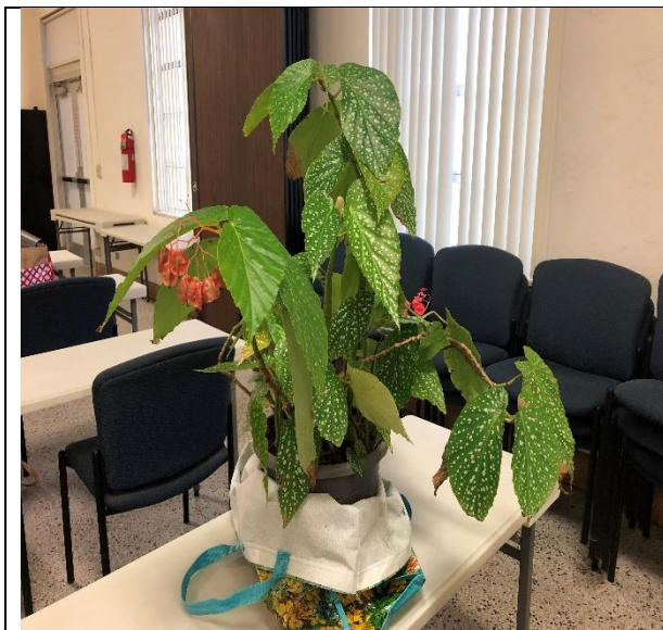
Cane Begonia – before grooming

Our July meeting was quite informative with Lois Petzold giving us valuable hints on grooming begonias for show. Members were encouraged to bring in plants they wished to groom. Here, we have an example of a cane begonia that before grooming was growing spindly and leggy. The after picture shows the shorter canes growing nicely and the trimmed back sections beginning to fill in the empty spaces.