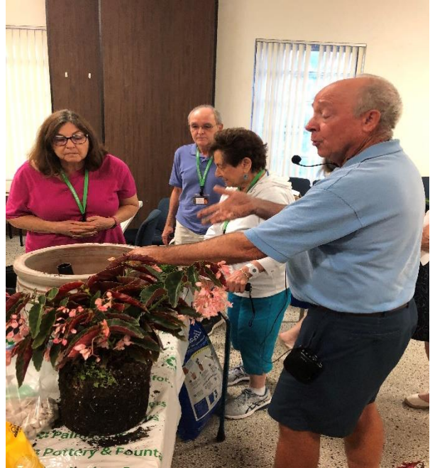
AquaPot – With soil in place atop reservoir - AquaPot Begonia Garden ready for plants