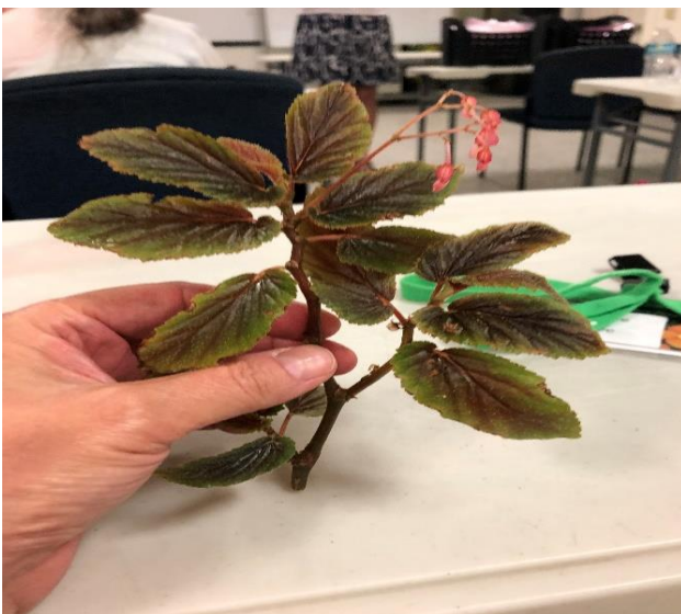
Cutting donated by Beverly Lichtenstein