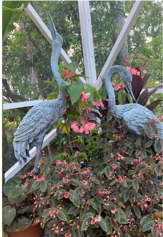
B. coccinea 'Pink'