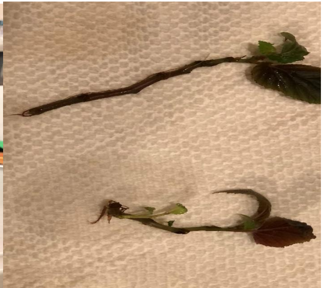
Same cutting – notice tiny roots appearing